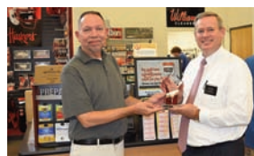
Hy-Vee #1386, Lincoln