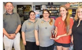
Roc's Stop & Shop, Lincoln