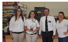
Hy-Vee #1467, Omaha