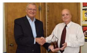
Save Mart, Lincoln