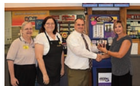
No Frills #3, Bellevue