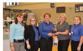
Hy-Vee #1465, Omaha