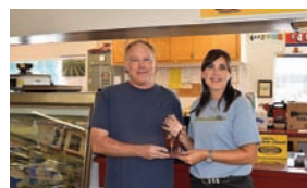
Corner Stop, Columbus