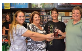
Coffin's Corner, Grand Island