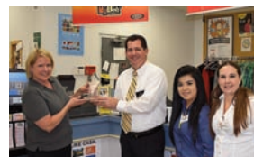
Hy-Vee #1468, Omaha