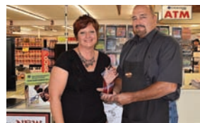
Grand Central Foods, York