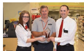
Hy-Vee #1620, South Sioux City