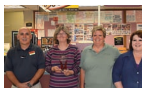
Skagway South Locust, Grand Island