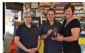
Pump & Pantry #16, York