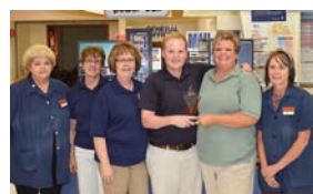
Skagway 5 Points, Grand Island