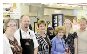
Allen's of Hastings, Hastings