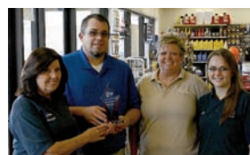
Pump & Pantry #23, Holdrege