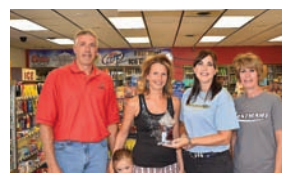
Fast Mart, Columbus