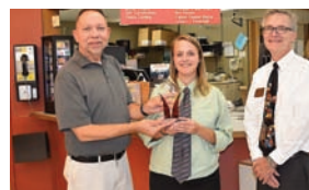
Russ's Market #2, Lincoln