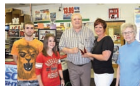
Gas 'N Snaks, Seward