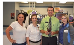
Hy-Vee #1535, Omaha