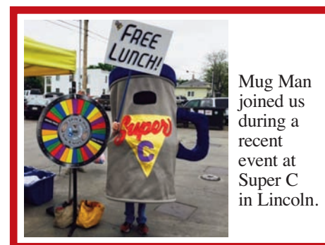
Mug Man joined us during a recent event at Super C in Lincoln.

Going forward, the Lottery will be closely monitoring game performance and use this information to close underperforming games. Initial game distributions, where every retailer receives a pack of tickets when a Scratch game launches, will be used to highlight specific games. Lottery Sales Representatives will also work with retailers to optimize their lottery point-of-purchase displays and reserve space for upcoming games. All of these efforts will make it easier to have the newest, most-sought-after Scratch games in your store for players to purchase.