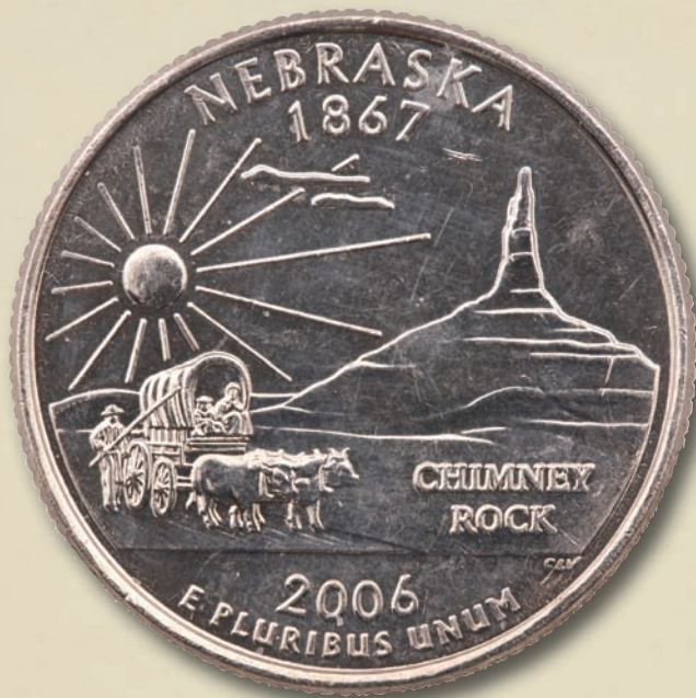
The 37th quarter released in the 50 State Commemorative collection.