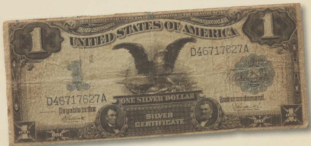
A one dollar silver certificate bill.