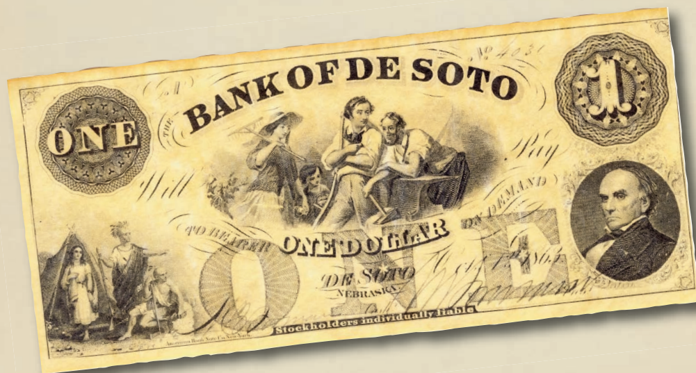
A one dollar bill from the Bank of De Soto, Nebraska.