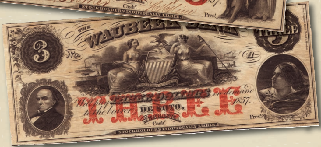
A two and three dollar bill from the Waubee Bank of De Soto, Nebraska dated May 1, 1857.