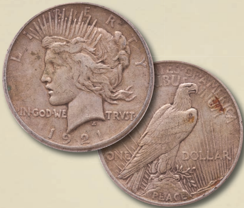
A 1921 Peace Silver Dollar.