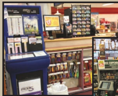
Sun Mart, North Platte