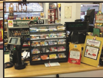
Kwik Stop #8, Ogallala