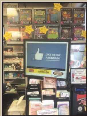
Jet Stop, Sterling

Each retailer has a different setup when it comes to lottery tickets and materials. If your display is clean and in view of the customer, they're more likely to purchase tickets along with other items. Here are some ticket display examples. If you're interested in revising your display, contact your LSR to discuss the options available to you.