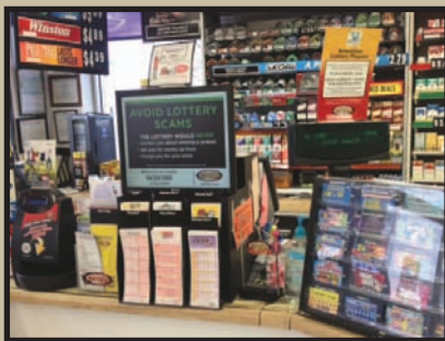
Kwik Stop #1, North Platte