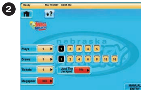
If the player wants more than two plays or would like their plays for more than one draw, touch the Mega Millions button. This screen will appear.