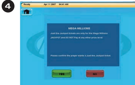
Before any Just the Jackpot ticket is printed, a warning message will appear. Please verify with your customer that they know this ticket will only be valid for the jackpot. No other prizes will be paid.

The new Mega Millions game launches on October 28 with the first drawing under the new matrix on October 31. New play slips will be provided to your store in advance of the change, so make sure to put the new slips out for players to use on October 28.