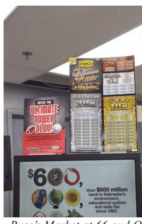
Russ's Market at 66 and O Street, Lincoln