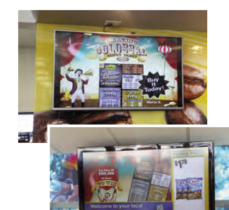
Super Ticket information is displayed on electronic screens in U-Stop and Pump & Pantry locations.