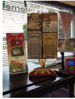
Trotter's Whoa & Go Express in Palmer