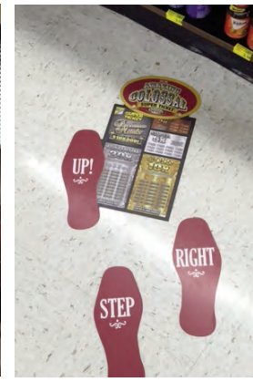
Russ's Market at 66 and O Street, Lincoln