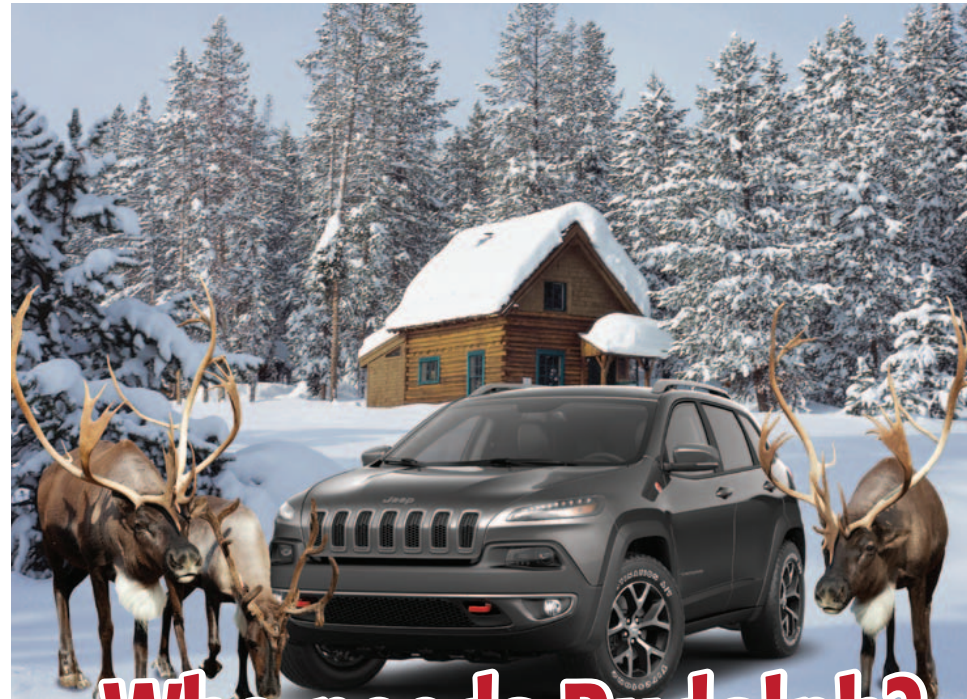
Actual prize may vary from the photograph.

Fans of the Nebraska Lottery also get access to exclusive contests on Facebook. You can like the Nebraska Lottery on Facebook at http://www.facebook.com/nebraskalottery for your chance to win event tickets, merchandise, and cash prizes. If your store has a Facebook page, send an e-mail to lottery@nelottery.com and we'll add it to our favorite pages list.