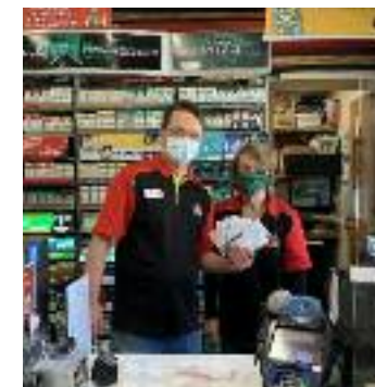
Casey's General Store in Ord is ready to sell another big winning ticket.