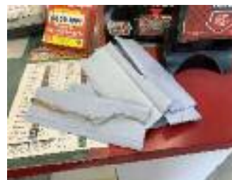
An 80-year-old man in Guide Rock created these temporary masks for shoppers at Country Corner.