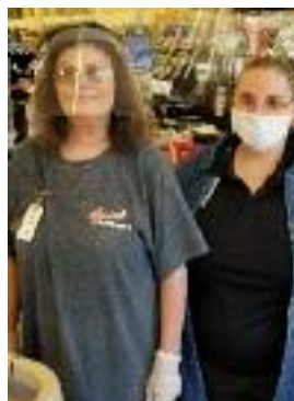
Clerks at Gary's Super Foods in North Platte serve customers safely using personal protective equipment.