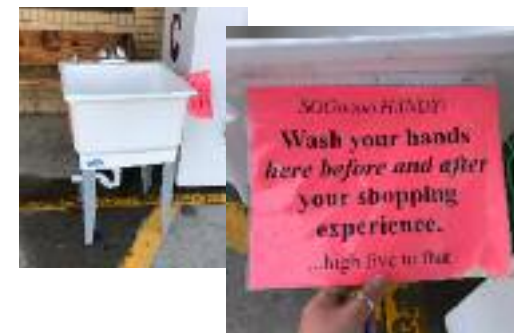
Fresh Foods in Gering offers a hand-washing station for customers. Handy!