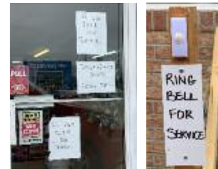
Customers at the Whiskey Barrel in Broken Bow can make purchases with the press of a button.