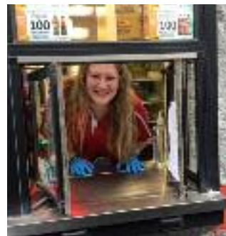
The U-Stop at 110 West O St in Lincoln offers a drive-thru option for customers.